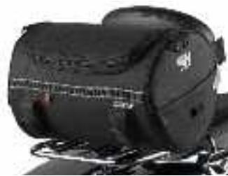
SHOWN FULLY EXPANDED