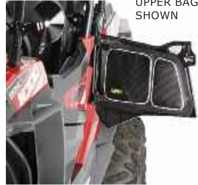
NRRG002 REAR UPPER BAG SHOWN