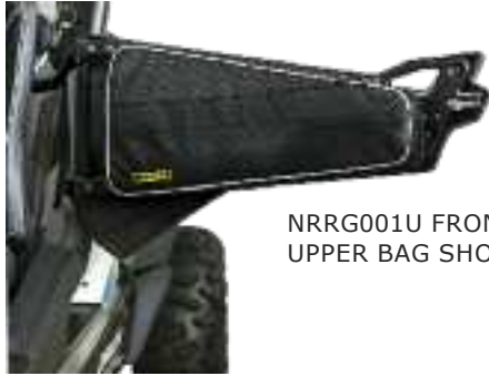
NRRG001U FRONT UPPER BAG SHOWN