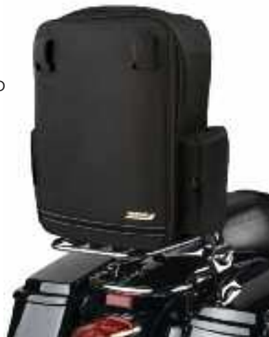
SHOWN FULLY EXPANDED