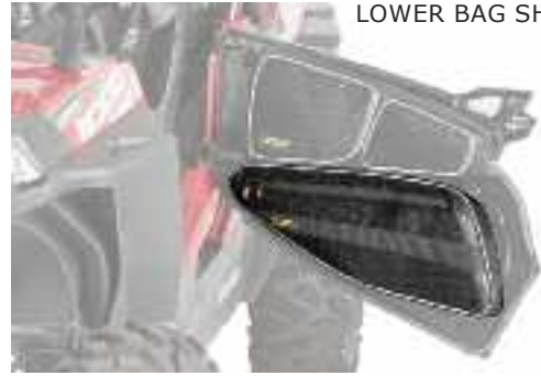
NRRG001L FRONT LOWER BAG SHOWN