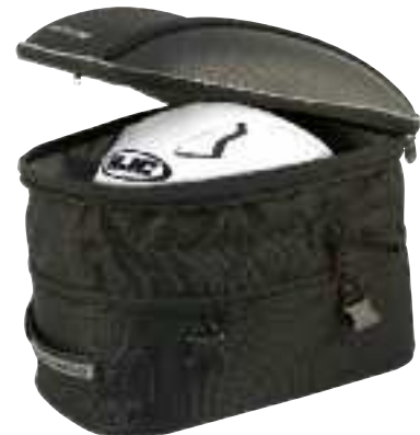
CL-1060-ST2 SHOWN FULLY EXPANDED